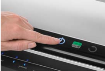
Touch panel power button

Fully automatic Laminator with InstaHeat