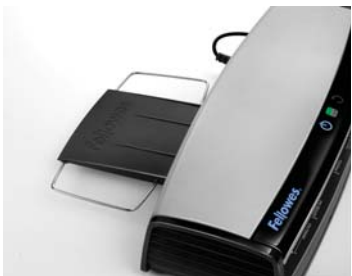
Back tray to support the laminated document